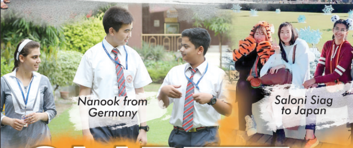
Nanook from Germany