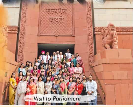
Visit to Parliament

At our school, Saarthi guides students through their academic and career journeys with clarity and confidence. Through counselling, expert sessions, school exchange programmes, awareness workshops, and digital engagement, it empowers learners to explore strengths, interests, and opportunities. By offering guided exposure and practical insights, Saarthi transforms uncertainty into informed choices, helping students set goals, plan their paths, and develop leadership, resilience, adaptability, responsibility, and the confidence to pursue excellence.