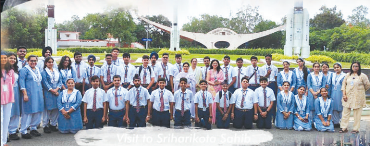
Visit to Sriharikota Satellite